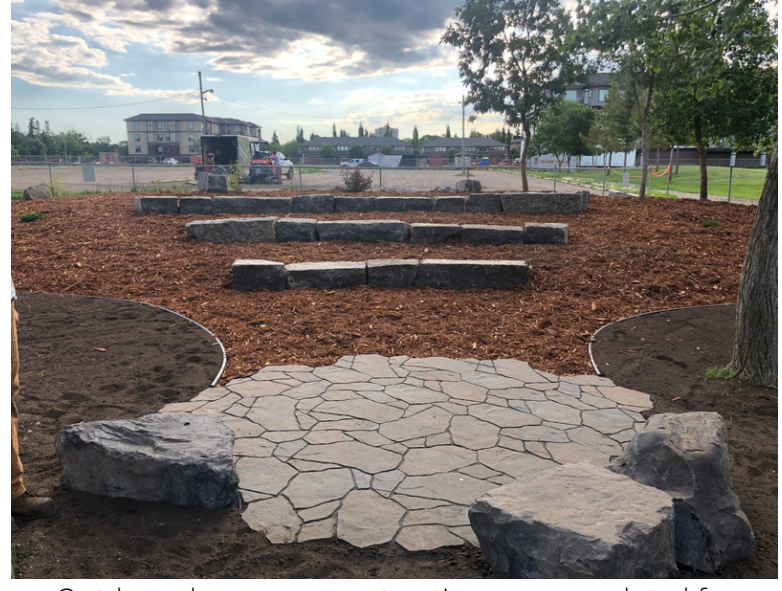
Outdoor classroom construction was completed for students and teachers to enjoy