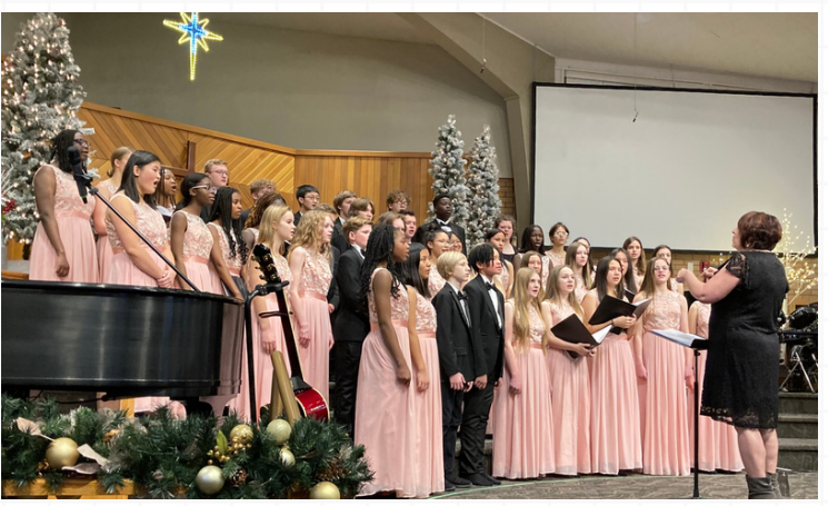
RCS High School Choir performing at Faith Baptist Church

To keep up-to-date on more events happening at RCS, follow us on Facebook and Instagram, or visit our website at www.reginachristianschool.org